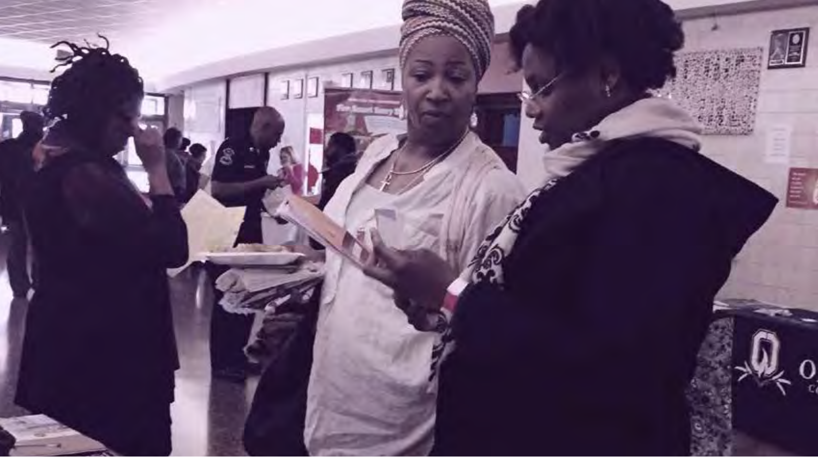
Village Birth International and Co-Mothering Syracuse partner to serve families and improve maternal and child health outcomes in upstate New York.

“Medical education has to teach racial health disparities as a disease caused by racism and lack of cultural competency in America. The two are interconnected.”