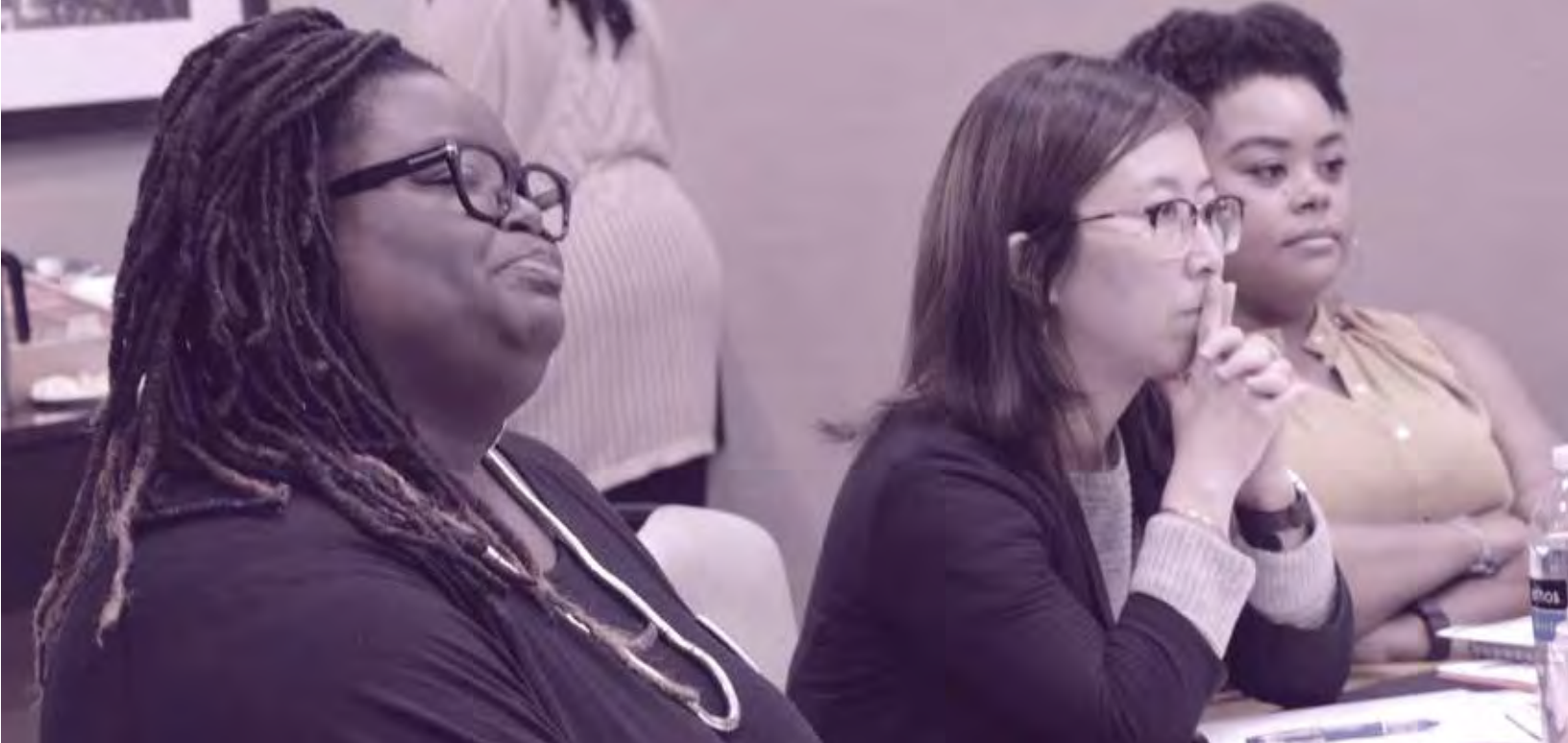
BMMA steering committee members and collaborators share ideas during the October 2017 Black Mamas Matter Alliance convening in New Orleans, Louisiana.