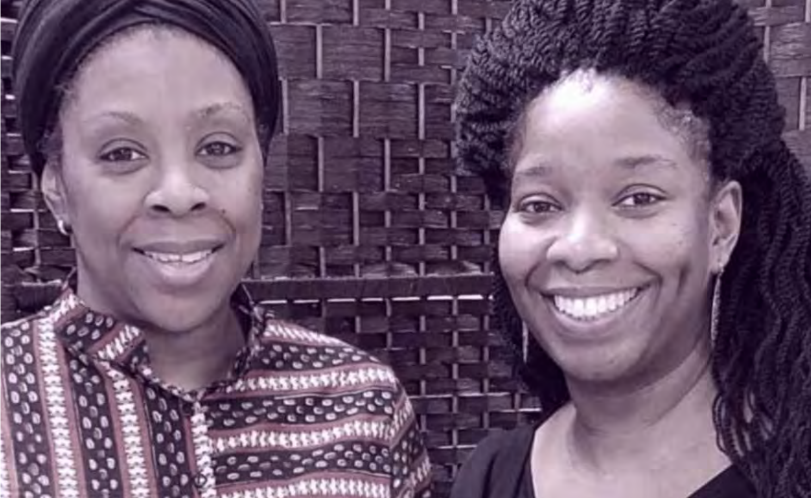
Village Birth International and CoMothering Syracuse staff use the the BMM toolkit to “address the human rights violations many women of African descent are facing in upstate New York.”

later ones, 37 and studies show that trained non-physician providers can perform them safely. 38 Thus, increasing the types of qualified clinicians allowed to provide early abortion care may ensure earlier access for women, especially in medically underserved areas. Nevertheless, most states currently require abortions to be provided only by licensed physicians. 39 Advocates interested in exploring these measures can look to California, Washington, and Connecticut for examples. 40