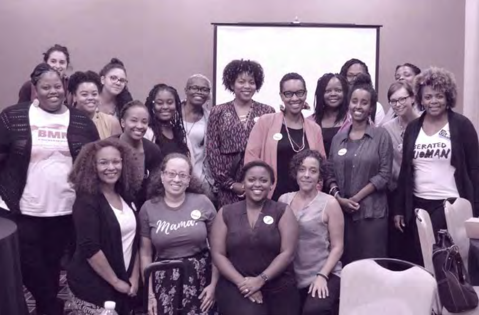
Black Mamas Matter Alliance steering committee members bring collaborators together for the third annual meeting of Black maternal health stakeholders.