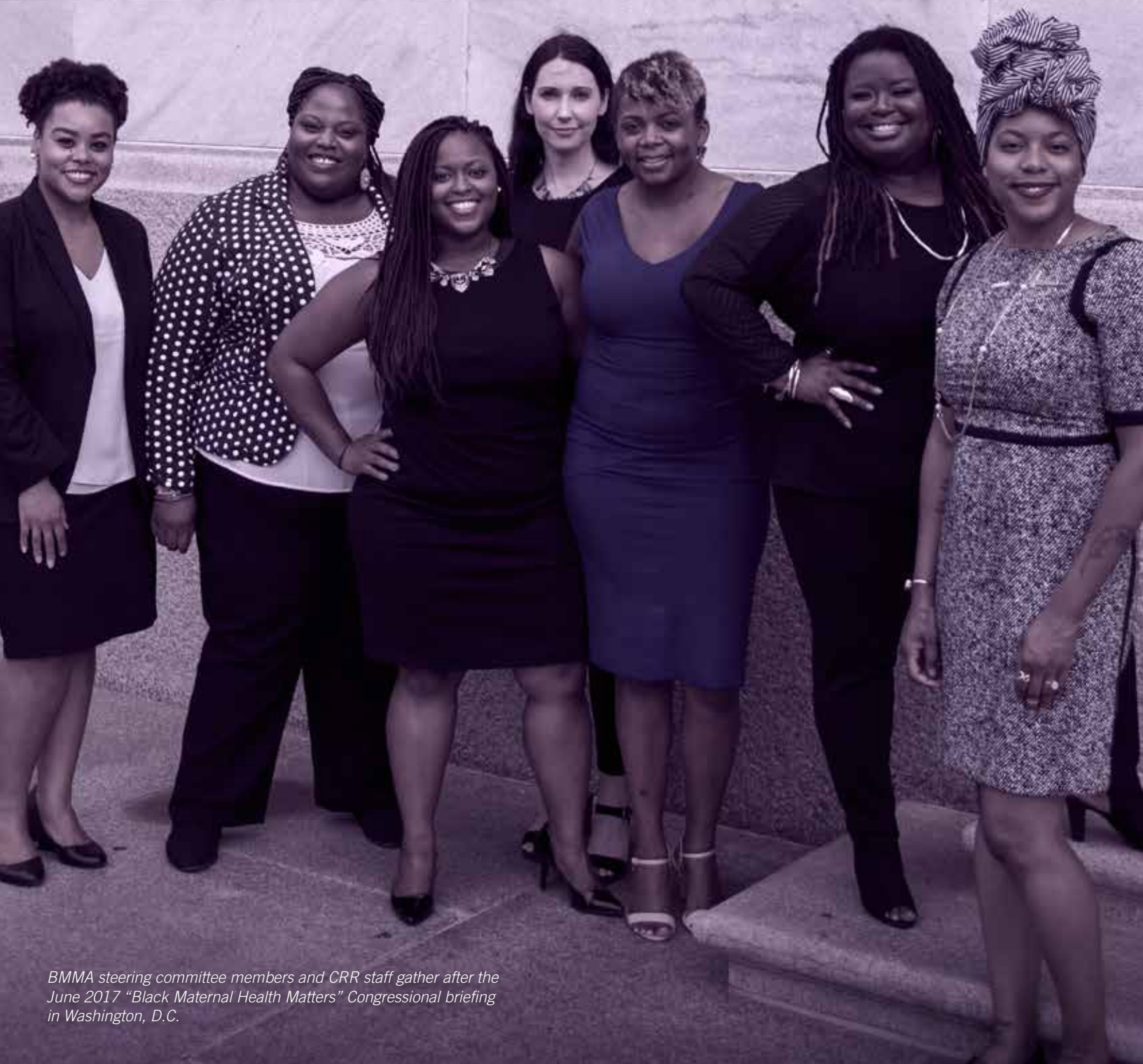
BMMA steering committee members and CRR staff gather after the June 2017 "Black Maternal Health Matters" Congressional briefing in Washington, D.C.