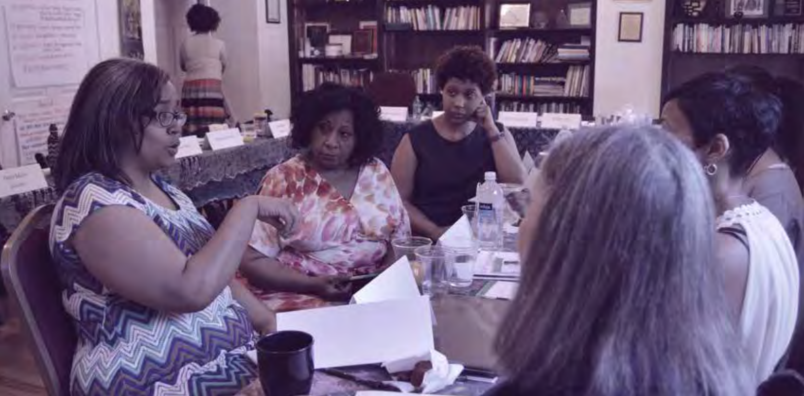
Researchers converse during the June 2015 Black Mamas Matter convening.