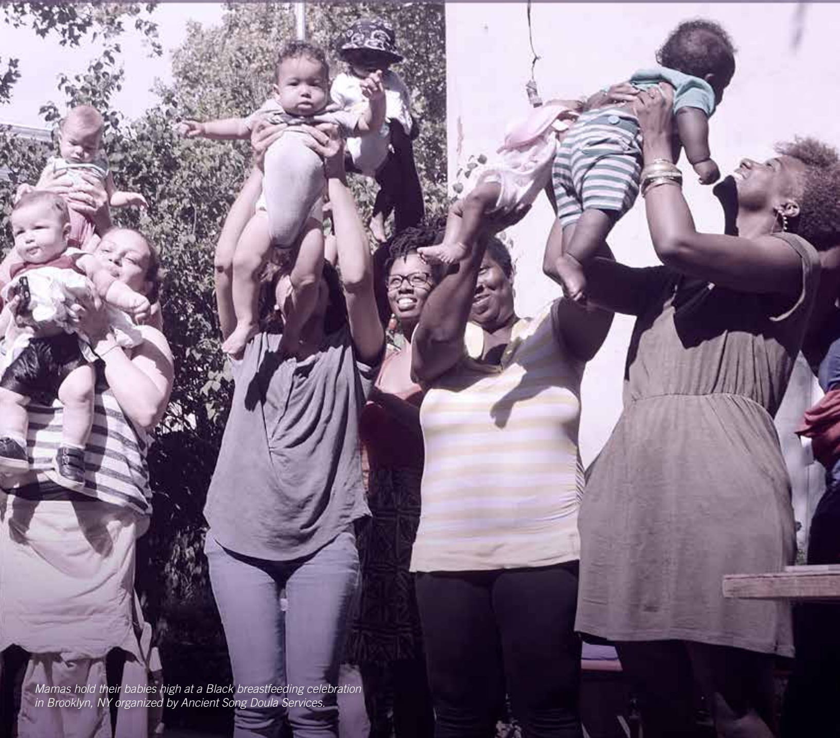
Mamas hold their babies high at a Black breastfeeding celebration in Brooklyn, NY organized by Ancient Song Doula Services.