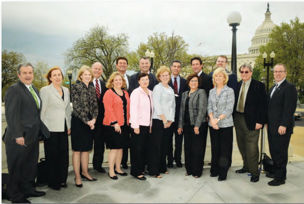
Hospital leaders in Washington, D.C.