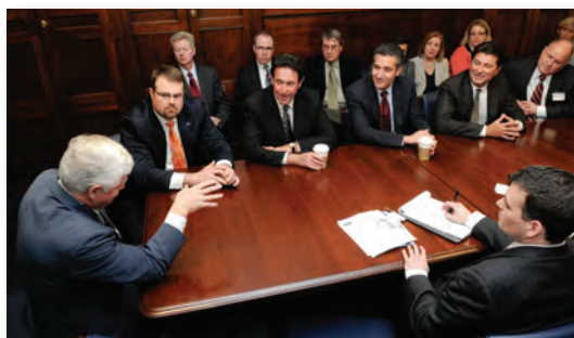
Connecticut hospital leaders meet with Representative John Larson (D-CT).