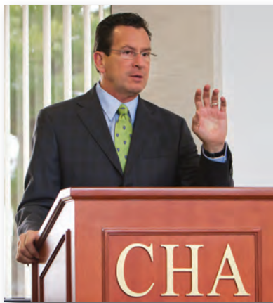
Governor Dannel P. Malloy.

When Dannel P. Malloy took office in January 2011, Connecticut had a Democratic governor for the first time in 20 years, resulting in new appointments, new leadership, and a critical shift in the legislative landscape as well. Although Democrats retained control of the Connecticut Senate and House of Representatives, they lost their veto-proof majorities, and legislative dynamics altered significantly as the Democratic majority no longer faced a member of the opposite party in the Governor's office.