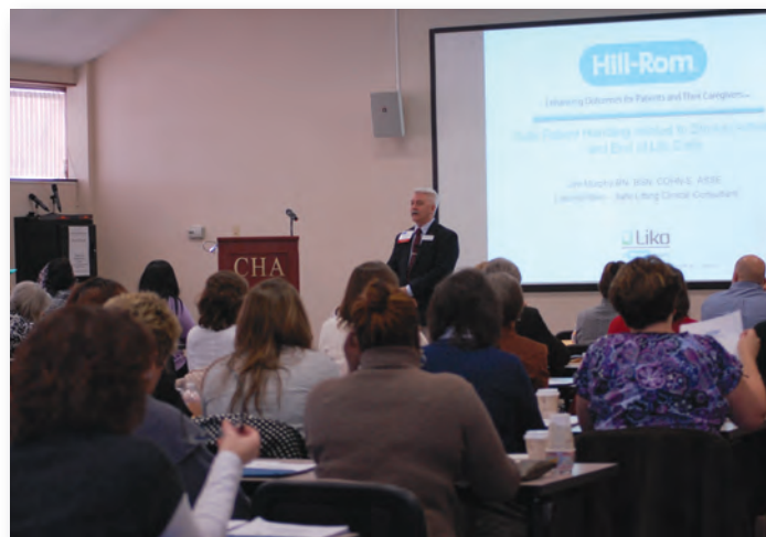
The fifth annual Smart Moves Forum on Safe Patient Handling.

CHA also again coordinated the Nurse Preceptorship Program , developed through CHA by a team of educators from hospitals and schools of nursing to provide a statewide curriculum for nurse preceptor preparation and development.