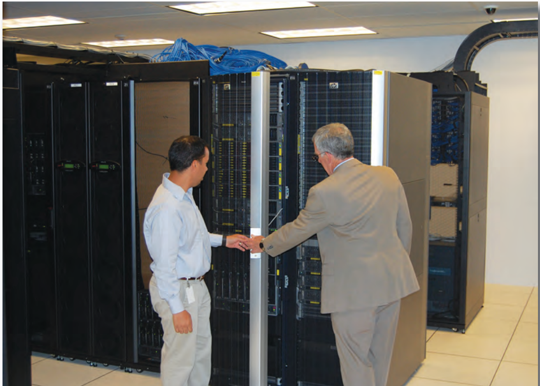
Inside CHA's data center.

The co-location service that ChimeNet launched in 2009 to support hospitals' disaster recovery plans will soon be fully populated with 46 racks for real-time backup of customers' critical computer systems in the event of a power failure or other interruption at their primary location. Expansion of the co-location data center to continue to provide a core set of services is now a priority.