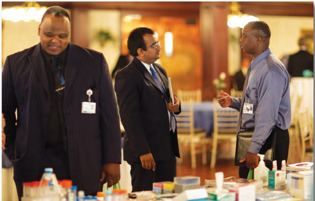
2010 CHA Supplier Diversity Vendor Fair.

As part of CHA's commitment to diversity, CHA continues to seek opportunities for expanding supplier diversity in hospitals by identifying product and service opportunities for Connecticut minority businesses to offer to hospitals. Twenty-four minority-business enterprises (MBEs) were added to CHA's SSP portfolio and CHA is continuing to work with the Greater New England Minority Supplier Development Council to create opportunities for MBEs as part of CHA's leadership in improving the health of our communities, eliminating disparities, and promoting diversity. CHA launched a dedicated website to promote these businesses, and will be hosting our second Supplier Diversity Vendor Fair concurrent with the CHA Annual Meeting at which senior executives and purchasing decision makers from member hospitals will be able to learn more about the products and services offered by CHA's MBE partners.